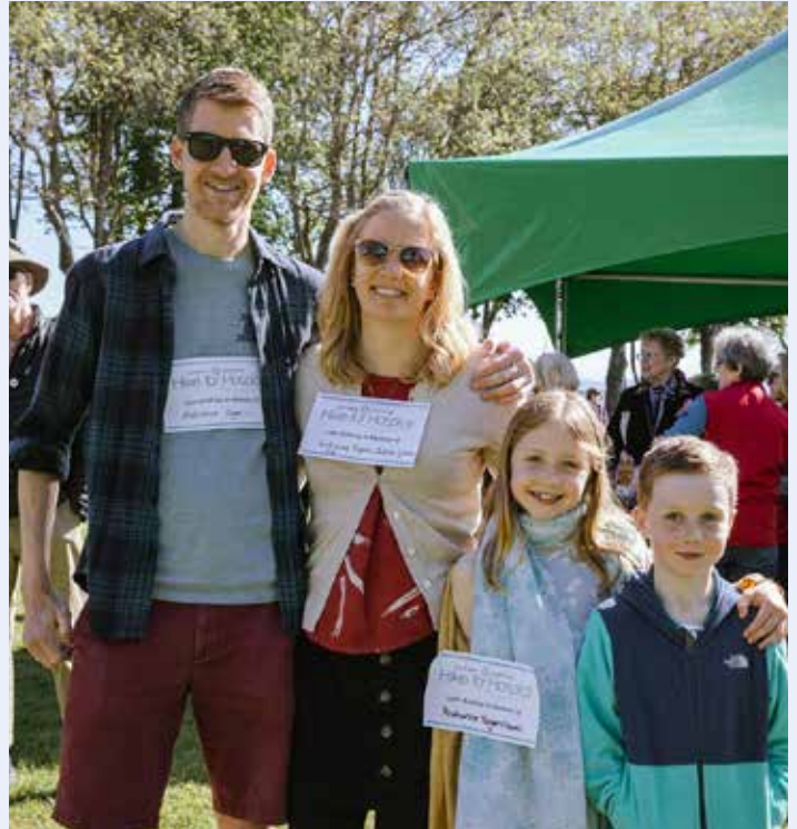
People of all ages Hike for Hospice to honour the lives of people that have touched theirs. Visit victoriahospice.org/hike to learn more and to register.